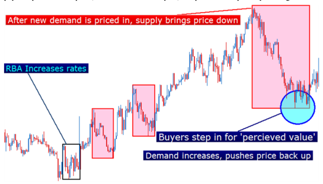
An example of supply and demand in response to Interest Rate Increase

Price aims to find a comfortable point, and will increase until there are no more buyers willing to pay that price. At this point, sellers outnumber buyers, and price will respond by moving down.