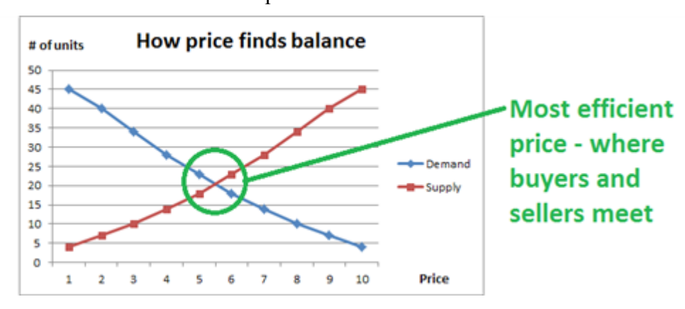
Supply and Demand curve, expressing the most efficient price at which buyers and sellers can meet

This is how price is discovered in a free market environment, the same way that prices are set on trading platforms around the world and it can be expressed in the chart below: