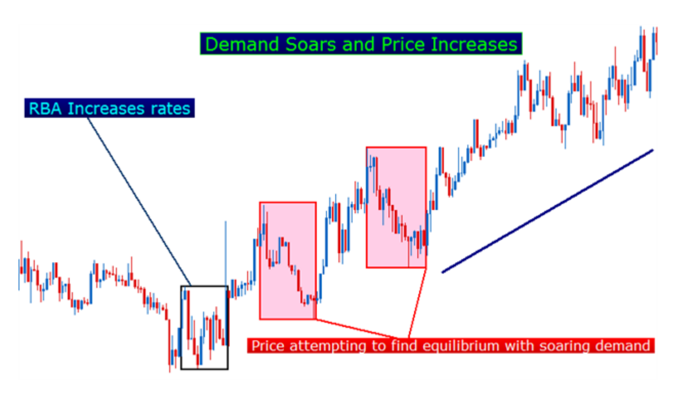
An example of supply and demand in response to Interest Rate Increase

Price aims to find a comfortable point, and will increase until there are no more buyers willing to pay that price. At this point, sellers outnumber buyers, and price will respond by moving down.